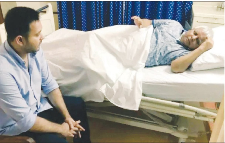
8. The Jharkhand High Court has sought a report from the state government on who ordered the transfer of jailed Lalu Prasad Yadav to the director's bungalow of a Ranchi